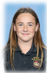
Sportswoman of the Term 4