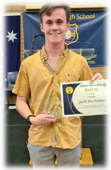
Images from Presentation Morning Nyngan High School 2023