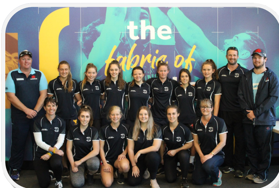
Girls Rugby Union Team