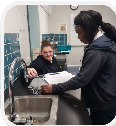
Stage 4 Chemistry