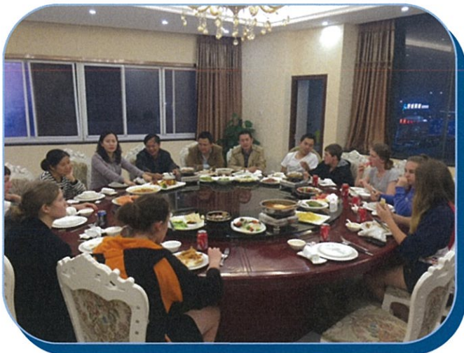
Your standard 10 course dinner