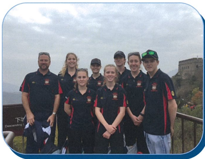
Walking the Great Wall of China