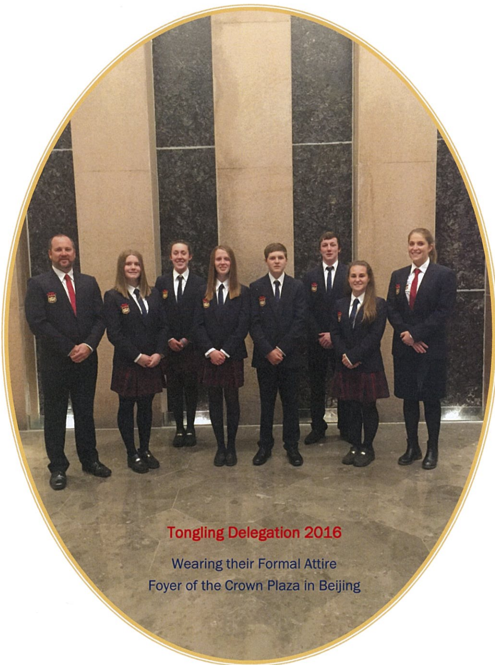
Tongling Delegation 2016

Wearing their Formal Attire Foyer of the Crown Plaza in Beijing