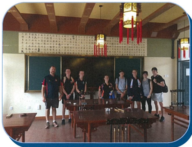
Visiting the new Tongling No1 School