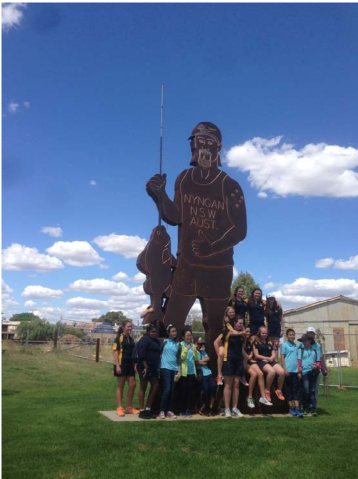
The Big Bogan with Tongling and Nyngan High School students.