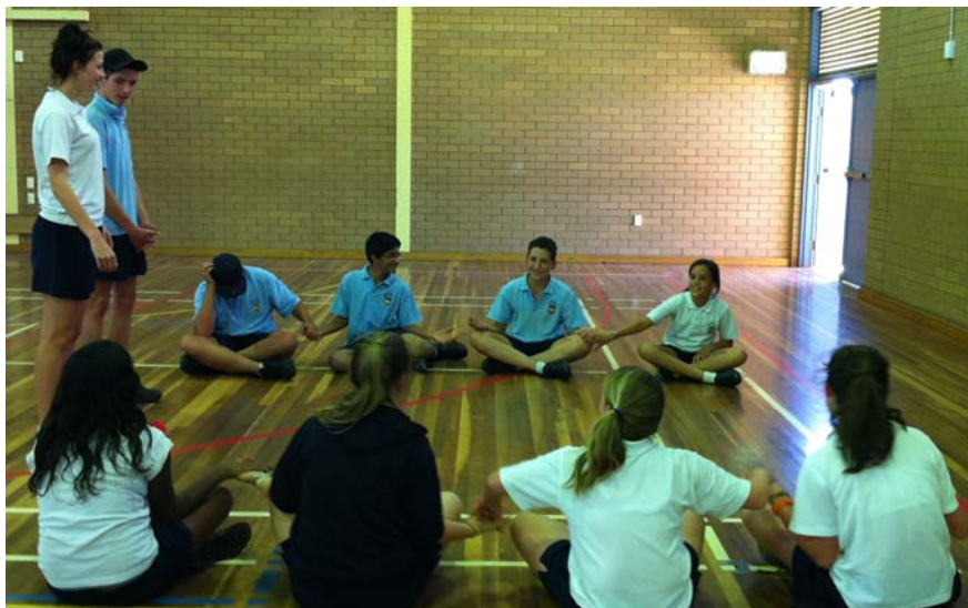
Photos from the Peer Support Workshops held on the 14th November, 2013 in the school gymnasium.

Students enjoyed doing a variety of activities which created lots of excitement and laughter.