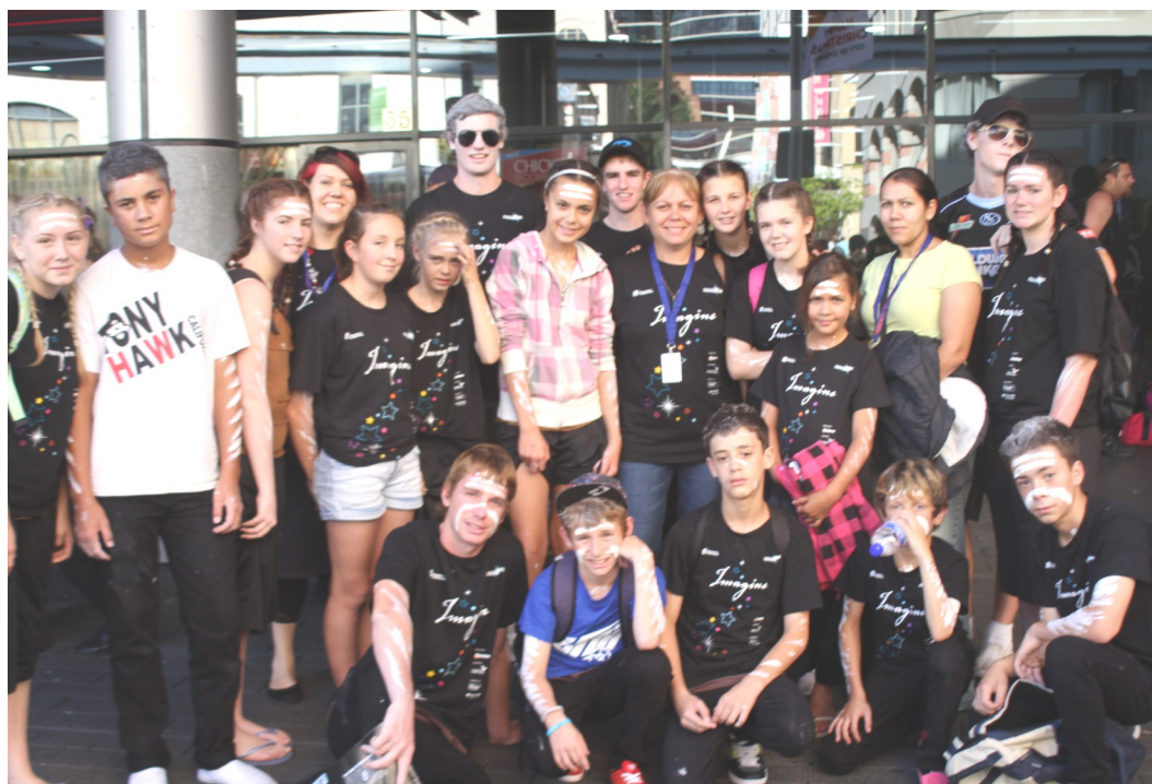
Students from Nyngan High School and Public School who performed last week in Sydney at the Schools Spectacular. And below our students on the BIG STAGE performing.